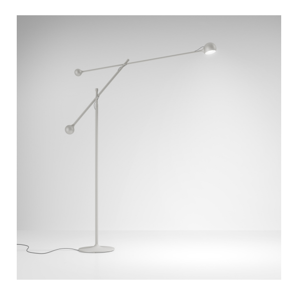
IP 20 ( € Dimmbar: + 0 -