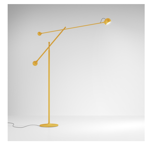
IP20 ( € Dimmbar: +0-