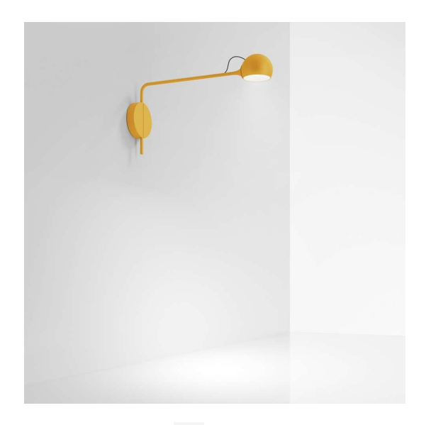
IP 20 ( € Dimmbar: + 0 -