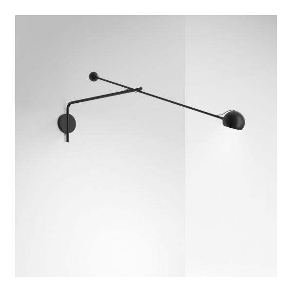
IP 20 ( € Dimmbar: + 0 -