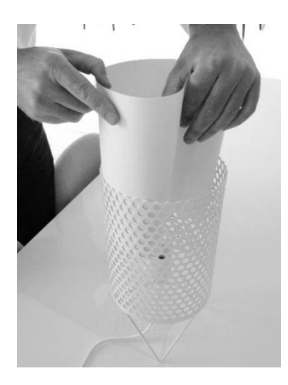
1. Make a fold on the inner shade and lift it out of the lamp.