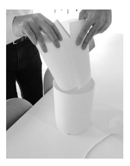
2. Fold the new inner shade with the adhesive tape pointing inward.