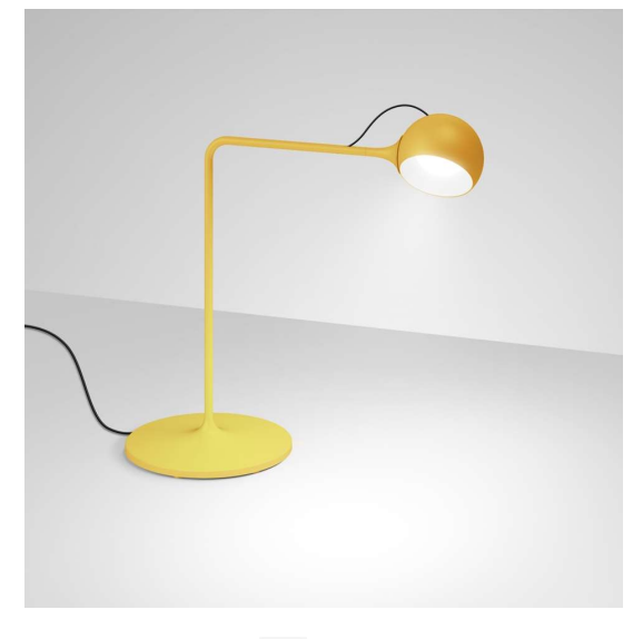
IP20 ( € Dimmbar: +0-