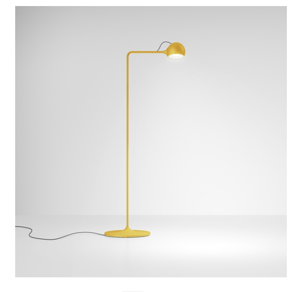
IP20 ( € Dimmbar: +0-